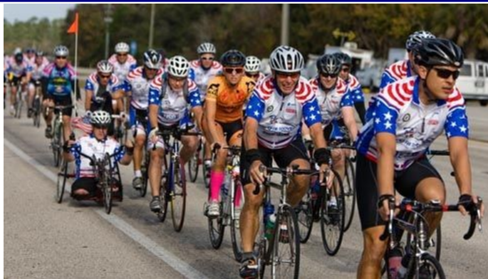
Leading up to The American Legion's 2010 National Convention, Ride 2 Recovery conducted a week-long cycling event from Minneapolis to Milwaukee. Wounded warrior cyclists rode nearly 530 miles with Medal of Honor recipient Gary Wetzel to the site of the Legion's 92nd National Convention.