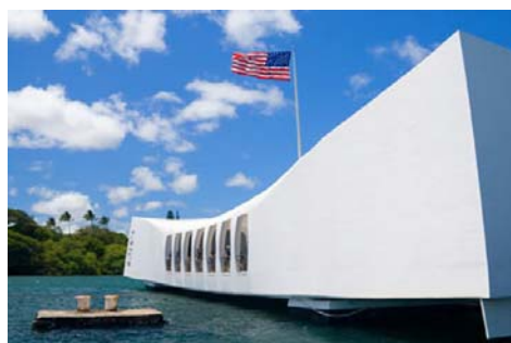
USS ARIZONA MEMORIAL

down the channel toward the open sea. Before she could clear the harbor, a second wave of 170 Japanese planes, launched 30 minutes after the first, appeared over the harbor. They concentrated their attacks on the moving battleship, hoping to sink her in the channel and block the narrow entrance to Pearl Harbor. On orders from the harbor control tower, the Nevada beached herself at Hospital Point and the channel remained clear.