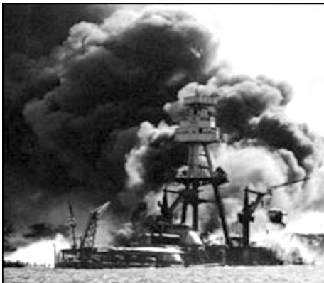
USS ARIZONA DURING THE ATTACK

It was a fateful day, the start of World War II for the United States, and a turning point in our history.