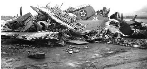
DESTROYED ARMY AIRCRAFT AT WHEELER FIELD

The USS West Virginia sank quickly. The USS Oklahoma turned turtle and sank. At about 8:10a, the USS Arizona was mortally wounded by an armorpiercing bomb which ignited the ship's forward ammunition magazine. The resulting explosion and fire killed 1,177 crewmen, the greatest loss of life on any ship that day and about half the total number of Americans killed. The USS California, USS Maryland, USS Tennessee and USS Nevada also suffered varying degrees of damage in the first half hour of the raid.