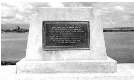
MEMORIAL PLAQUE NEAR THE WRECK OF USS UTAH

There was a short lull in attack at about 8:30a. At that time the USS Nevada, despite her wounds, managed to get underway and move