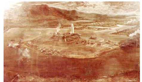
TSUGUJI FUJITA 1942 PAINTING, 'ATTACK ON PEARL HARBOR'

at Ewa and the Army Air Corps fields at Bellows, Wheeler and Hickam were all bombed and strafed. The purpose of the simultaneous attacks was to destroy the American planes before they could rise to intercept the Japanese.