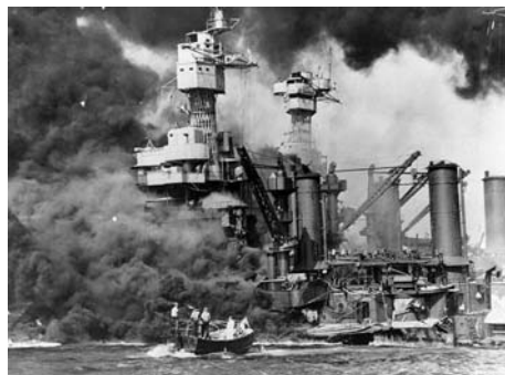
RESCUING SURVIVORS NEAR USS WEST VIRGINIA

At 7:00a, an alert operator of an Army radar station at Opana spotted the approaching first wave of the attack force. The officers to whom those reports were relayed did not consider them significant enough to take action. The report of the submarine sinking was handled routinely, and the radar sighting was passed off as an approaching group of American planes due to arrive that morning.