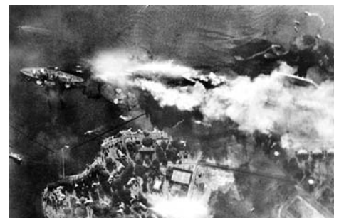
PEARL HARBOR'S 'BATTLESHIP ROW'

Of the 100 ships in Pearl Harbor, the primary targets were the eight battleships anchored there. Seven were moored on Battleship Row along the southeast shore of Ford Island while the USS Pennsylvania (BB-38) lay in drydock across the channel. Within the first minutes of the attack, all the battleships adjacent to Ford Island had taken bomb and/or torpedo hits.